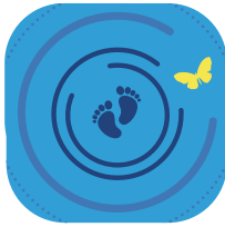
Essential Introduction to Perinatal and Infant Mental Health