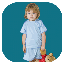
Infant Mental Health Developing Positive Early Attachments