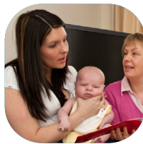
Understanding Maternal Mental Health