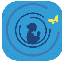
Keeping Baby in Mind