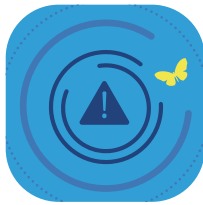
Risk in the Perinatal Period