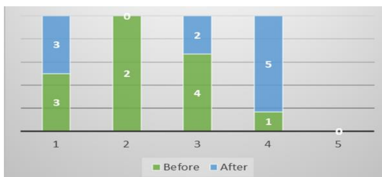
Figure 1: Confidence to be a practice educator to an arts therapies trainee

Educational Impact: Key findings from original scoping exercises with 2022/23 trainee cohort highlighted the need for resource development as outlined above. Open ended questions about what might be included in future iterations and what could be done differently informed the content of the current resource pack. Once completed, the resource pack was sent out for 3 rounds of focus group testing.